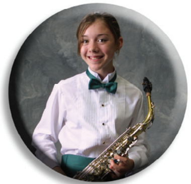
Brag Buttons $5 - $7.50