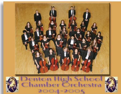
8 x 10 Orchestra Groups