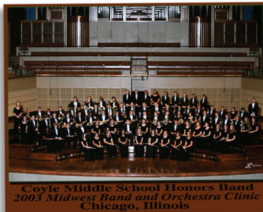
8 x 10 Band Groups

Section photos are SUB-groups from the MAIN Group, such as, Trumpets, Low Brass, Violins, Percussion, etc. Some organizations have multiple GROUPS, such as Chamber Orchestra, Philharmonic Orchestra, Jazz Band, Honor Band, and have SUB-Groups within the big group. Please check with director BEFORE ordering Section photos!