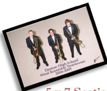
5 x 7 Section Photos